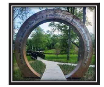
Arch in Vietnam Veterans Memorial Park in Trumbull, CT.

<u>Independence Day</u> is an opportune time to think about America's freedom. Each service member