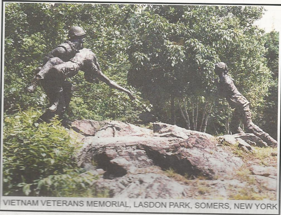
VIETNAM VETERANS MEMORIAL, LASDON PARK, SOMERS, NEW YORK